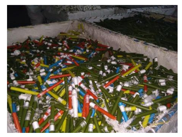
Fig.1 Waste yarn in Bobbins

western countries for their spices in the barter system. During the late 17th and 18th century there were large export of the Indian cotton to the western countries to meet the need of the European industries during industrial revolution. Consequently, there was development of nationalist movement like the famous Swadeshi movement which was headed by the Aurobindo Ghosh.